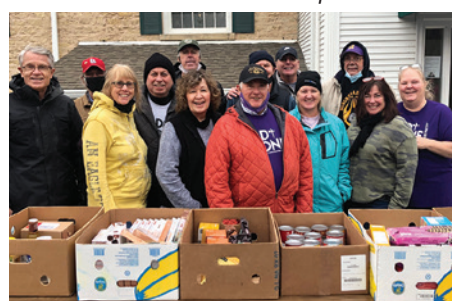
2022 Old Stone Church Pantry