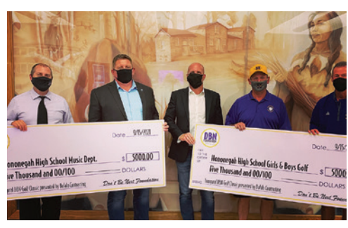
2022 HHS Donations