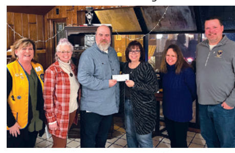
2022 Wimpy's Fund