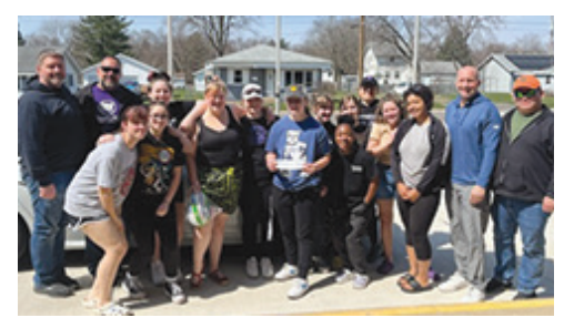
HHS Girls Rugby 2023